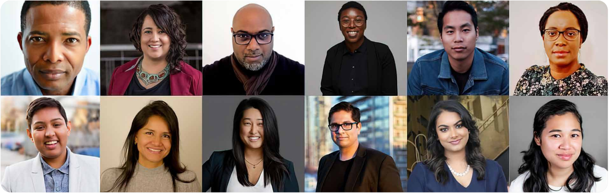
2022 Reelworld Producer Program participants Bell Media and Reelworld Film Festival and Screen Institute creating the Reelworld Producers Program for Black, Indigenous and Persons of Colour (BIPOC) candidates.